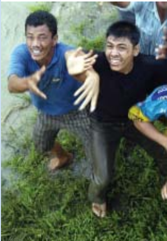
Tsunami survivors reach up for help in Indonesia.