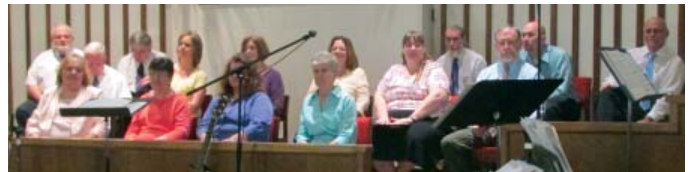
North Charleston Baptist Church was one of several churches that presented an Easter musical on Palm Sunday. Some churches presented a message in song on Easter morning, and others on Easter night. Pictured above is the North Charleston choir.