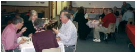
(above) About 20 pastors and their wives gathered at First Southern Baptist, Fairmont , for a Valentine Banquet. Pictures of the couples were provided by the Monongahela Association. The couples enjoyed good food and encouraging fellowship.