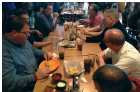
Pastors from the Pioneer Association met for lunch. The fellowship time was to share prayer needs, discuss concerns, trade ideas, and get to know each other. The men met at La Roca, in Cross Lanes.